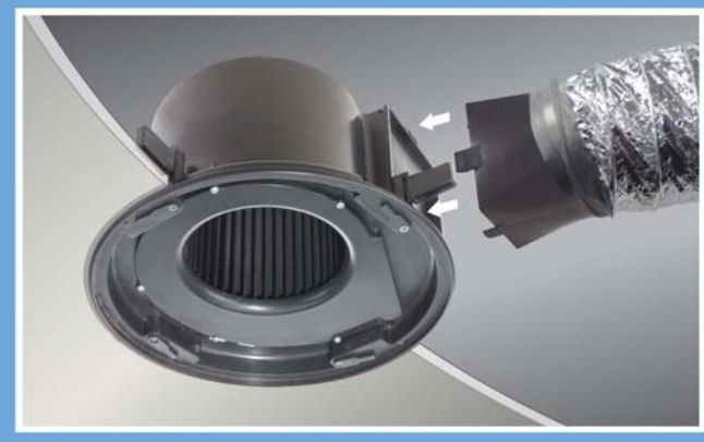
Long clip-in spigot makes installation and duct connection easier.